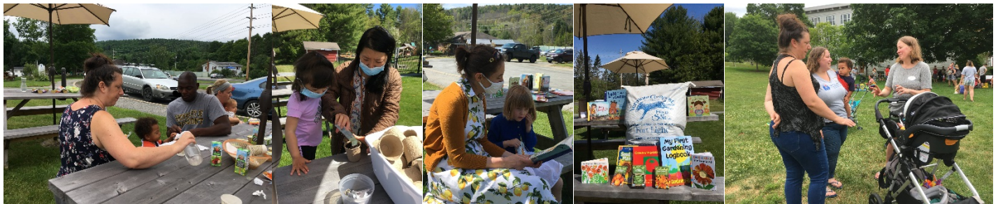
Pictures from the Family Center of Washington County Planting Seeds with Children Parent Event