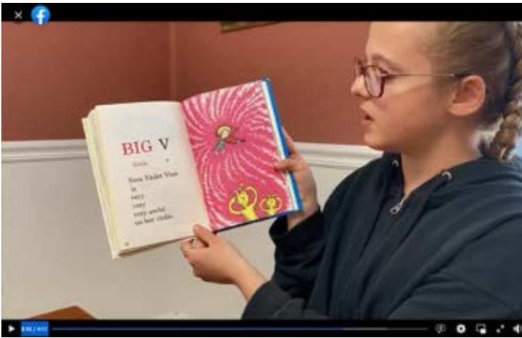
Family Place Week of the Young Child events included daily readings of children's books on our Facebook Page by members of The Family Place Board, Advisors, staff and our WOYC sponsors.

The Family Center of Washington County saw a 300% increase in food pantry usage, serving 512 families. 362 families received diapers and 627 meals were distributed (this does not include the 487 school lunches picked up and dispersed to families in the beginning of the pandemic). They have delivered 3,050 Everyone Eats meals.