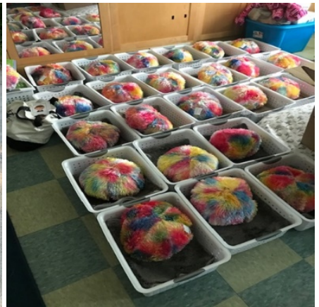
Family Place Activity Kits and feelings boxes: Children's activity kits were provided to families at walking playgroups and mailed to families who were more remote. The third picture is of "feelings baskets" which were distributed to families enrolled in our early care and education program. The contents of each basket were similar to what children find in the "feelings area" (comfort and calming area) in our classroom.